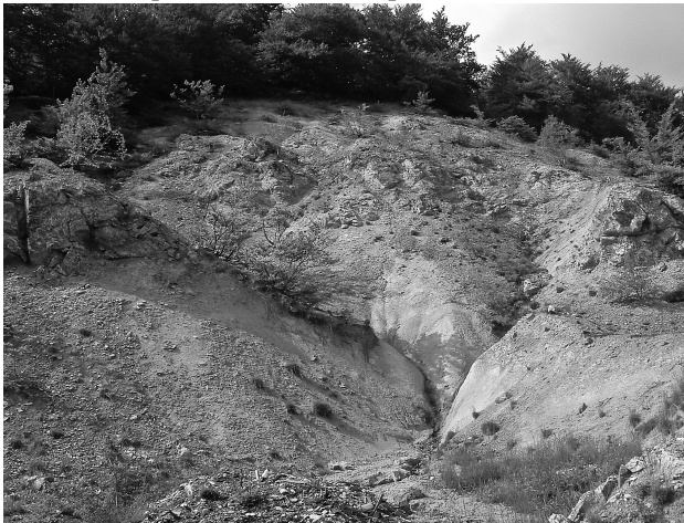
Picture 1- Extensive erosion

The intensive erosion processes are not expressive.