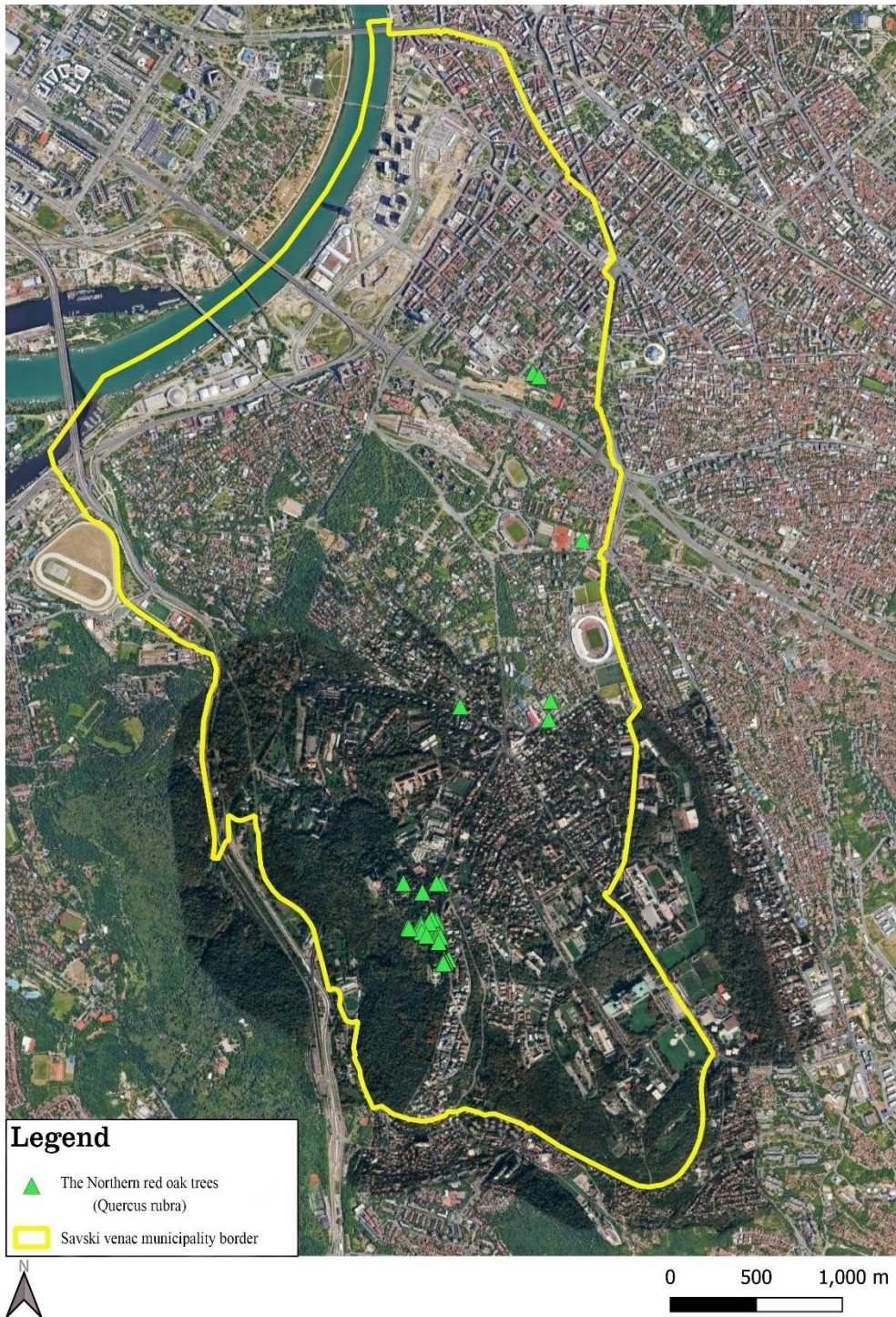
Figure 1. Locations of the analyzed northern red oak trees in Savski Venac municipality, Belgrade, Serbia