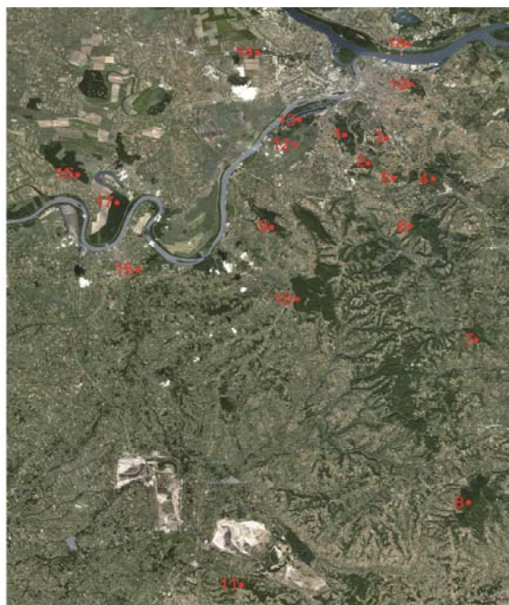
Figure 1. Overview of locations where research was conducted

Most forests in the territory of Belgrade belong to the Posavsko-Podunavski forest region, which is managed by Forest Estate Belgrade, whereof 16,686.70 hectares are state-owned and 15,636 hectares are privately owned. A portion of forests in the territory of Lazarevac Municipality belong to the Podrinjsko-Kolubarski forest region, which is managed by the Forest Estate Boranja-Loznica, whereof 379.37 hectares are state-owned and 6,172 hectares are privately owned. From May 2010 to April 2011, research in microbiological activity of forest soil was conducted at 19 locations of forested areas in both state and private ownership in the territory of Belgrade (Figure 1).