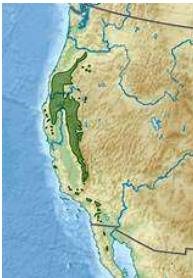
Map 1. Distribution of Lybocedra in Natural Habitats Across the USA.

“Incense-cedar grows on many kinds of soils developed from a wide variety of parent rocks- rhyolite, pumice, andesite, diorite, sandstone, shale, basalt, peridotite, serpentinite, limestone, and granitic or metamorphic: equivalents. It is particularly adept at extracting soil phosphorus and calcium and excluding surplus magnesium. Incense-cedar grows on many kinds of soil developed from a wide variety of parent rocks- rhyolite, pumice, andesite, diorite, sandstone, shale, basalt, peridotite, serpentinite, limestone, and granitic or metamorphic equivalents. It is particularly adept at extracting soil phosphorus and calcium, and excluding surplus magnesium” (Powers and Oliver).