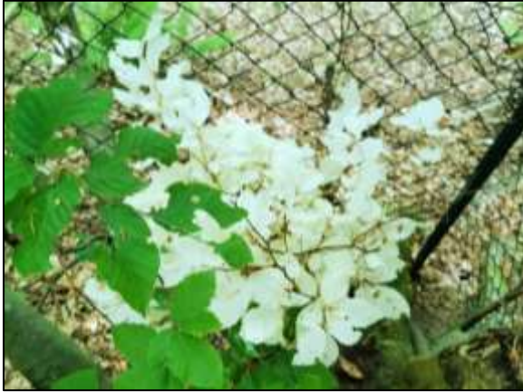
Picture 1. Albino beech from the studied site

dwarf and bush-like, and the authors point out the possible parasitic nature of the individual and the potential importance of the underground mycorrhizal network.