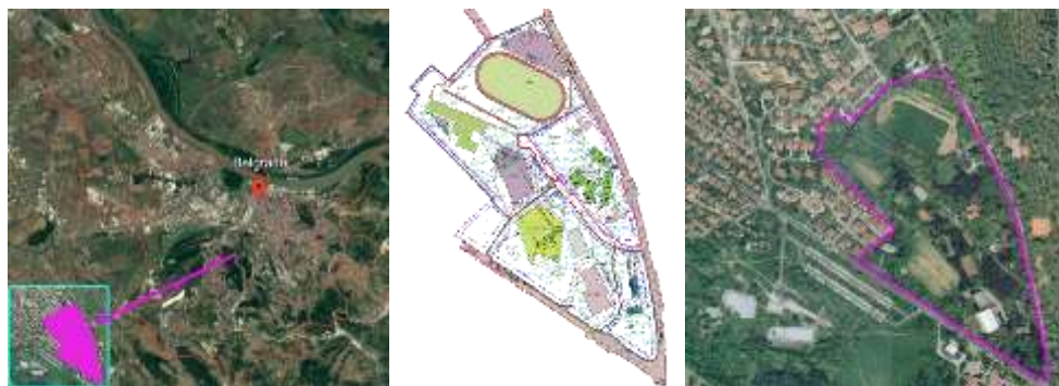
Figure 1. Location of the analysed space, construction plan of the facilities

The Visual Assessment of green areas was conducted in 2016 in the area of the Sports and Recreational Centre (SRC) Košutnjak, located within the Institute of Sport and Sports Medicine of the Republic of Serbia. This site is situated within the urban forest, which forms part of the green infrastructure of the city of Belgrade.