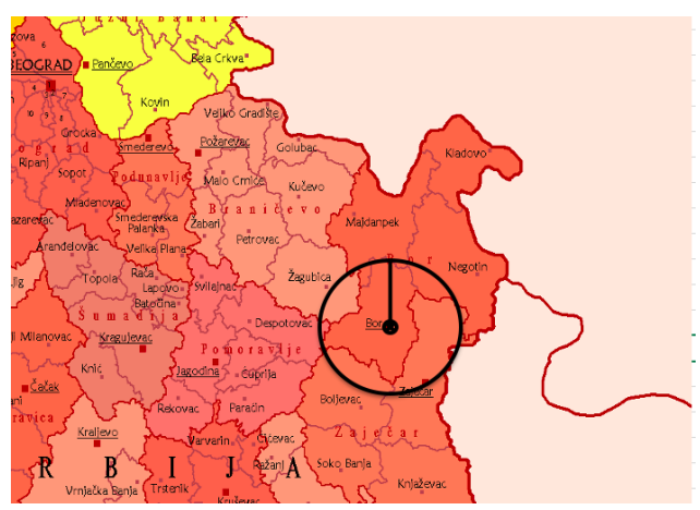
Figure 1 Map of the city administrative area and Bor District

Bor is a city and administrative center of the Bor District in eastern Serbia. Map of the city is shown in Figure 1.