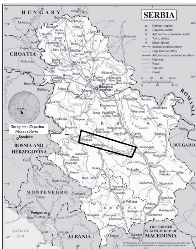
Figure 1. Location map of Zapadna Morava valley with selected sample sites

This paper presents the results of testing the water quality for irrigation during the summer seasons 2013, in the basin of the Zapadna ("West") Morava River, from Kratovska stena to Maskare, in three monitoring cycles on 16 selected sites belonging to agricultural area under irrigation. It was established that the surface water quality corresponded to the standards for irrigation according to temperature, pH, conductivity (EC w ), dissolved solids (TDS), ion balance: Ca 2+ , Mg 2+ , K + , Na + , chlorides (Cl - ), sulfates (SO 4 2- ), Sodium Adsorption Ratio (SAR). The content of the following trace elements and heavy metals was determined: Cr, Ni, Pb, Cu, Zn, Cd, B, As, Fe, Hg.