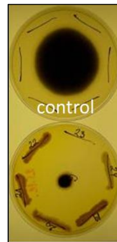
Figure 2. Zones of inhibition caused by P. chlororaphis isolates toward Phoma sp.