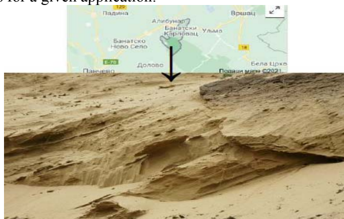
Figure 1. Sand on the locality Vinogradi (the territory of the municipality of Alibunar)

Examination of the quality of natural aggregate (sand) of Vinogradi locality, Banatski Karlovac was performed in accordance with Article 202 of the Rulebook on classification and categorization of reserves of solid mineral raw materials and keeping records on them (Official Gazette of SFRJ, No. 53/79), ie in accordance with the standards prescribing the quality of mineral raw materials for a given application: