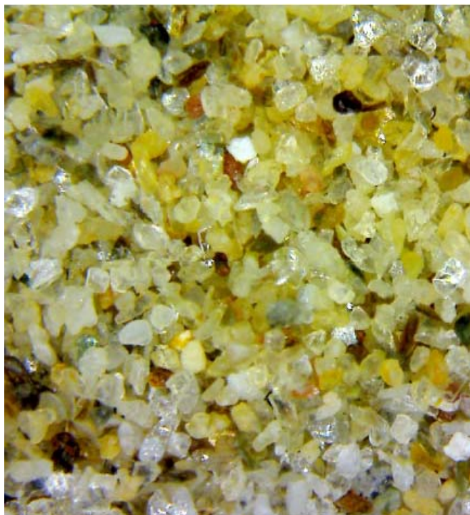
Figure 3. Microscopic appearance of fraction 0.250 / 0.125 mm, binocular magnification 40X